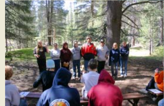
Gathering at the Amphitheater