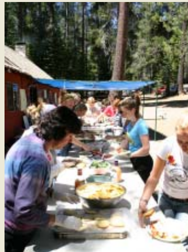
Enjoying an Outdoor Buffet

Nearby Shaver Lake offers swimming, boating, and fishing.