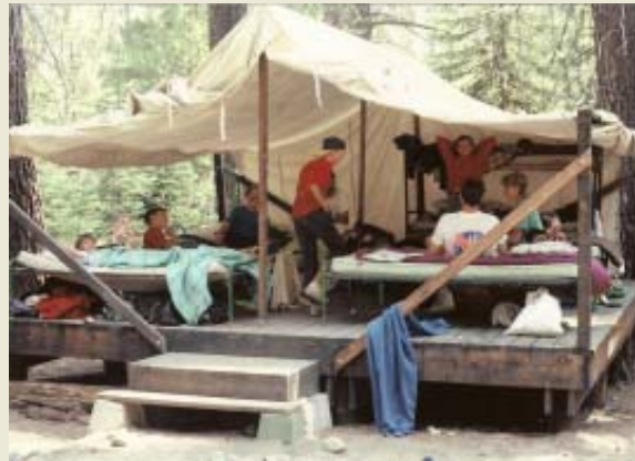
Hanging Out in Tent Cabin

Do your own cooking in our fully equipped kitchen.