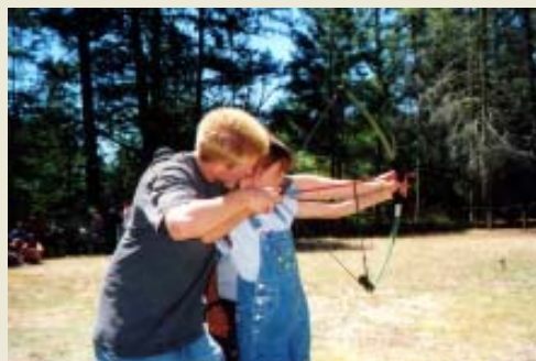
Enjoying an outdoor archery lesson