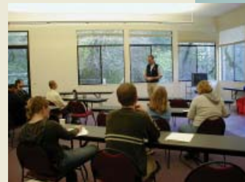
Meeting in the Kiva