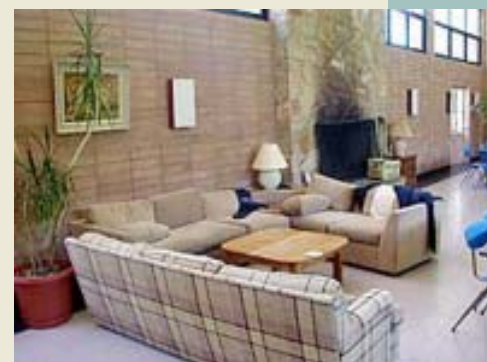
Lounge area in Dining Hall