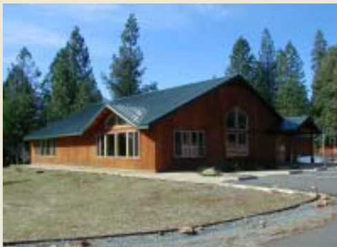
Irvin Dining Hall

Delicious meals are served in this large meeting/dining hall with an adjacent carpeted conference room.