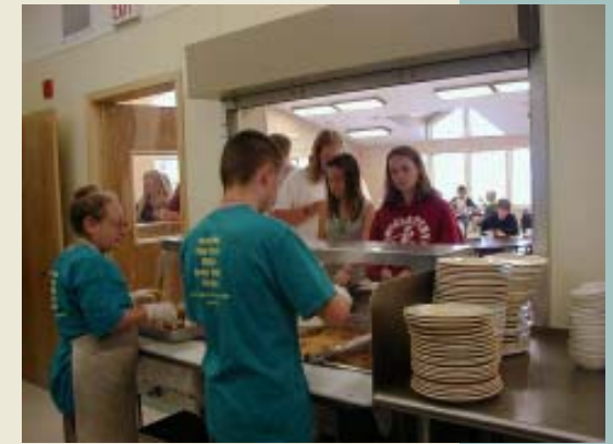
Dishing Up Scrumptious Food

Easy access to historic mining towns, Tahoe National Forest, American River, and Sugar Pine recreational areas.